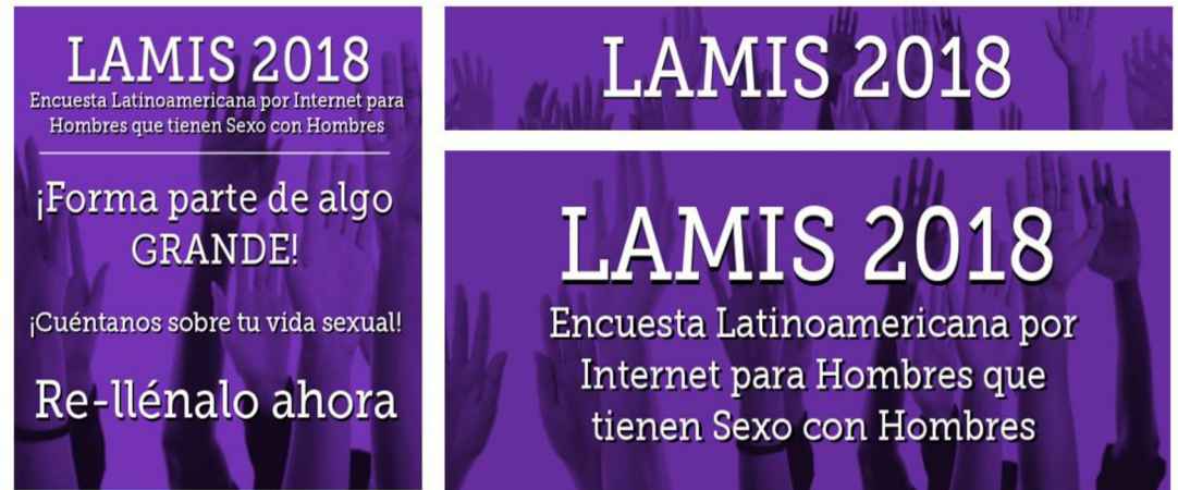
Fig 1. Examples of banners for the promotion of the LAMIS-18 survey.

https://doi.org/10.1371/journal.pone.0277518.g001