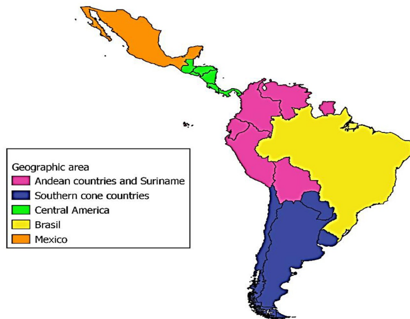
Fig 3. Grouping criteria by geographic area among LAMIS-2018 participant countries from the Latin American region. Geographical areas: 1. Andean countries and Surinam included Surinam and the Andean countries Bolivia, Ecuador, Peru, Colombia and Venezuela. Suriname was included in this group due to its geographic proximity to Venezuela and its small population size. French Guiana was included in EMIS-2017 as a French overseas territory; Guyana was not included due to its anti-gay legislation 2. The southern cone countries include Argentina, Chile, Paraguay and Uruguay, located in the southernmost part of the American continent, which, like a large peninsula, defines the southern part of the South American subcontinent. 3. Central America includes Costa Rica, El Salvador, Guatemala, Honduras, Nicaragua and Panama, located between Mexico and South America. 4. Brazil, given its size and the fact that it is the only Portuguese-speaking country. 5. Mexico, given its size and northeast LA location.

https://doi.org/10.1371/journal.pone.0277518.g003